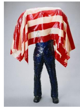
4 KOJIMA Nobuaki, Untitled (Body) , 1964/1982