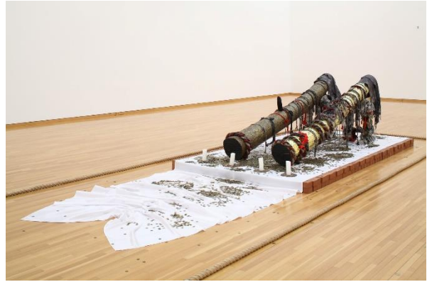
2 KIKUHATA Mokuma, Slave Genealogy (coin) , 1961/1983