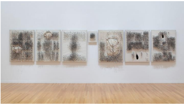
3 NAKANISHI Natsuyuki, Clothespins Assert Churning Action , 1963/1981 Photo: Keizo Kioku © NATSUYUKI NAKANISHI