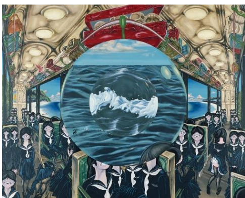
4 NAKAMURA Hiroshi, Circular Train A (Telescope Train) , 1968