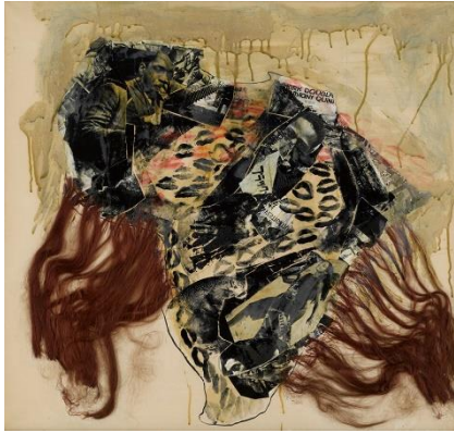
1 TABE Mitsuko, Placard , 1961

To request press images, please contact our Public Relations team with the caption number of the desired image.