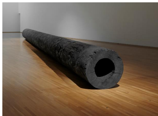
7 ENDO Toshikatsu, Fountain , 1991