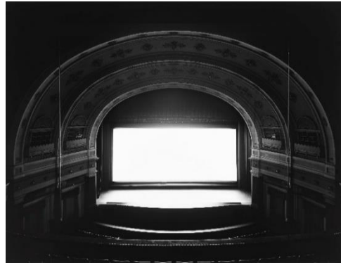
8 SUGIMOTO Hiroshi, Goshen, Indiana , 1980