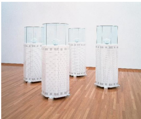
9 KASAHARA Emiko, Untitled, A Flower of Stone , 1991