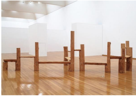
6 SUGA Kishio, Partition of Realm , 1982