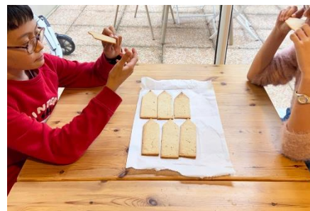
2. Yuni Hong Charpe, Still on our tongues , 2022