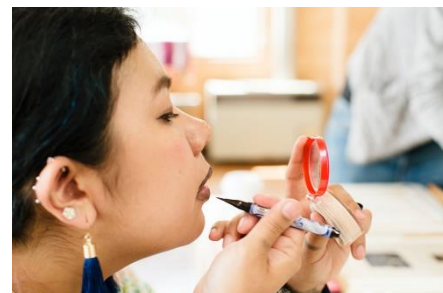
4. Mayunkiki