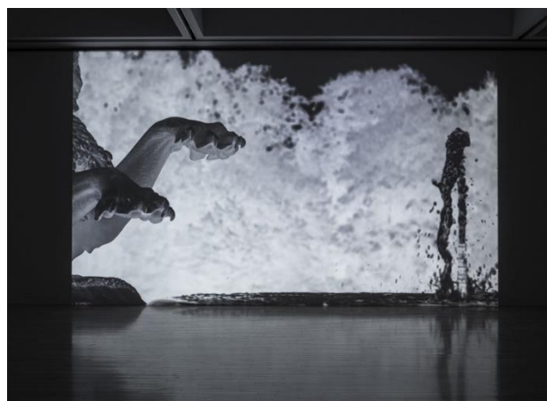
8 MIYAKE Saori, Garden (Potsdam) , 2019

Contact Museum: Museum of Contemporary Art Tokyo Public Relations Mihoko Nakajima / Chiako Kudo E-MAIL: mot-pr@mot-art.jp TEL: +81-3-5245-1134 URL: https://www.mot-art-museum.jp/en