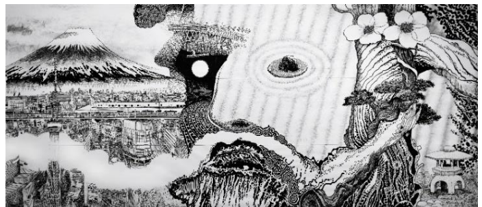
4 Oscar OIWA, Zeus, the God of Olympia , 2019 Collection of the Artist Courtesy of the Japan Foundation / Maison de la culture du Japon à Paris

Contact Museum: Museum of Contemporary Art Tokyo Public Relations Mihoko Nakajima / Chiako Kudo E-MAIL: mot-pr@mot-art.jp TEL: +81-3-5245-1134 URL: https://www.mot-art-museum.jp/en