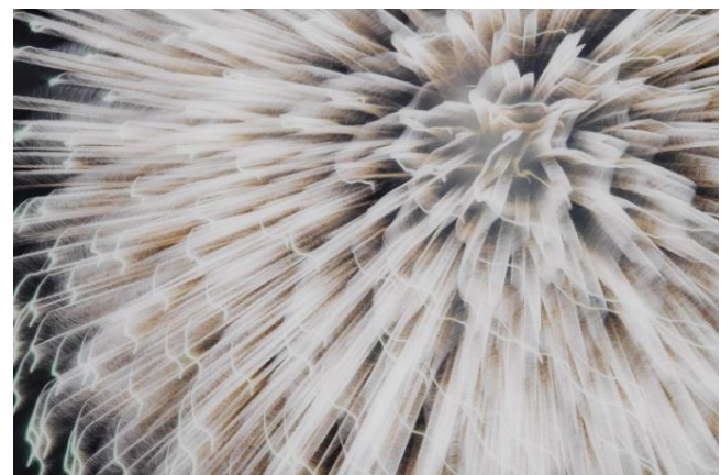
7 NINAGAWA Mika, Light of , 2015