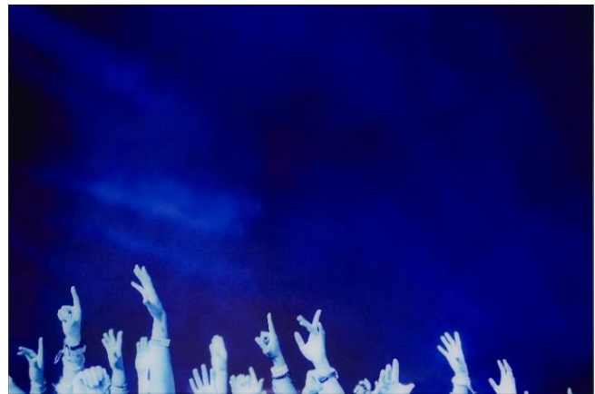
6 NINAGAWA Mika, Light of , 2015