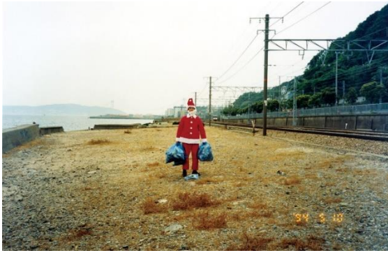
9 SHIMABUKU, Christmas in the Southern Hemisphere , 1994