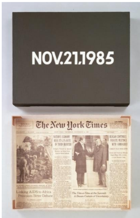
5 KAWARA On, NOV.21,1985, from "Today" series, 1966-2013, 1985