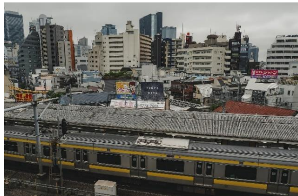
2 Chim ↑ Pom, May, 2020, Tokyo (Okubo Station) - Drawing a Blueprint -, 2020 ©Chim ↑ Pom Courtesy of the artist, ANOMALY and MUJIN-TO Production