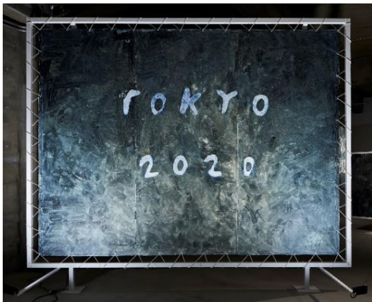
1 Chim ↑ Pom, May, 2020, Tokyo (Okubo Station) - Drawing a Blueprint -, 2020

The Museum of Contemporary Art Tokyo houses approximately 5,500 artworks in its extensive collection with a focus on art of the postwar years. Each installment of the "MOT Collection" exhibition serves to introduce artworks in the collection from various themes and angles.