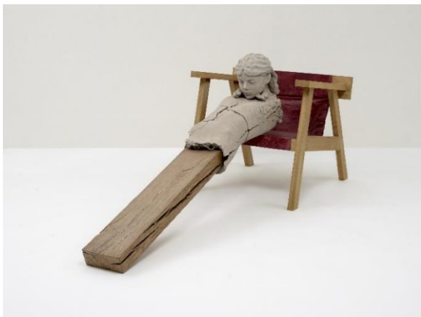
11 Mark Manders, Dry Figure on Chair, 2011-15

Presented on the third floor is the special exhibit "Storage and Display," consisting of an installation of the works of Mark MANDERS. The artist's solo exhibition "The Absence of Mark Manders" which was held until June at the museum, had been temporarily closed for over a month due to the effects of the pandemic. Therefore with the cooperation of the artist himself and owners of the work, the museum has organized "another exhibition" in which the works presented in Manders' solo exhibition are reconfigured and introduced in a new manner through the direction of the artist.