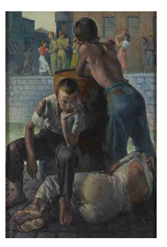
4. SHINKAI Kakuo, We Gained Independence, but?, 1952