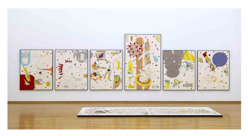
3. OKAMOTO Shinjiro, Crumbling Blocks, New Guernica, 2002