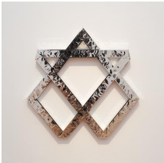
9 Monir Shahroudy FARMANFARMAIAN, Heptagon , 2008