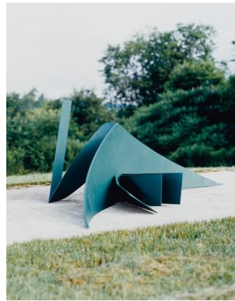
5 ANZAI Shigeo, Anthony Caro, "Sea Change" , 1970 [Photographs for "CARO by ANZAI", 1992] 1994, 2014