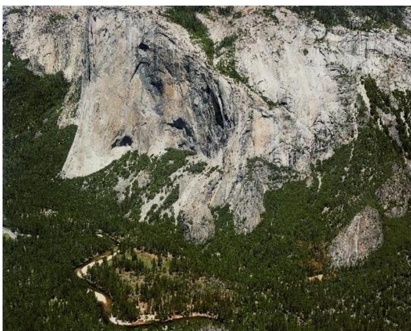
13 MATSUE Taiji, YOSEMITE 35140 , 2023