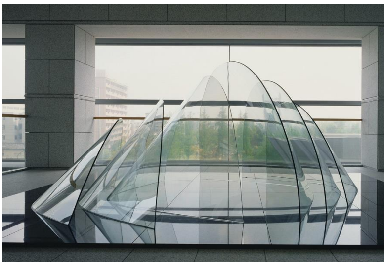
10 TADA Minami, Phase , 1989