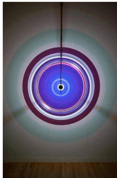
7 Olafur ELIASSON, Beyond- human resonator , 2019 Photo: Kazuo Fukunaga © Olafur Eliasson