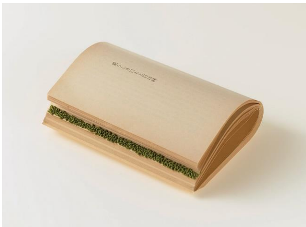
8 FUKUDA Naoyo, Nine Stories #2 , 2003