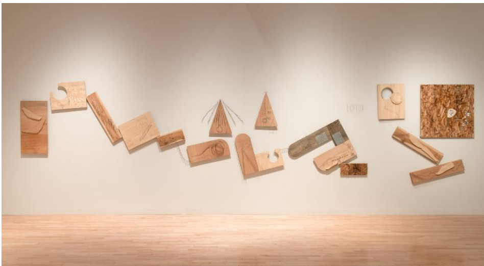
3 MITSUSHIMA Takayuki, From Kiyosumi- Shirakawa station of HANZOMON line to the Museum , 2019