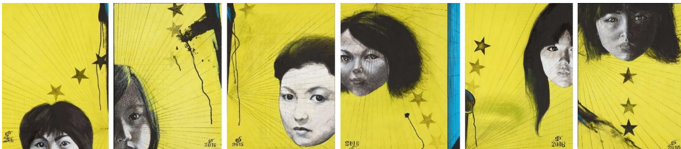
11 NAKAMURA Hiroshi, Eye from Chiaroscuro , 2015-16