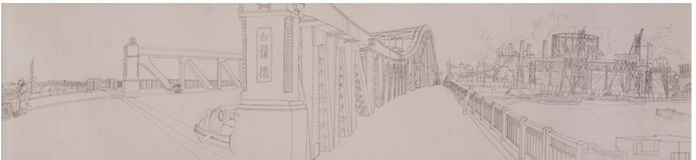
2 FUJIMAKI Yoshio, Scenes from the Sumidagawa River No.2 , 1934