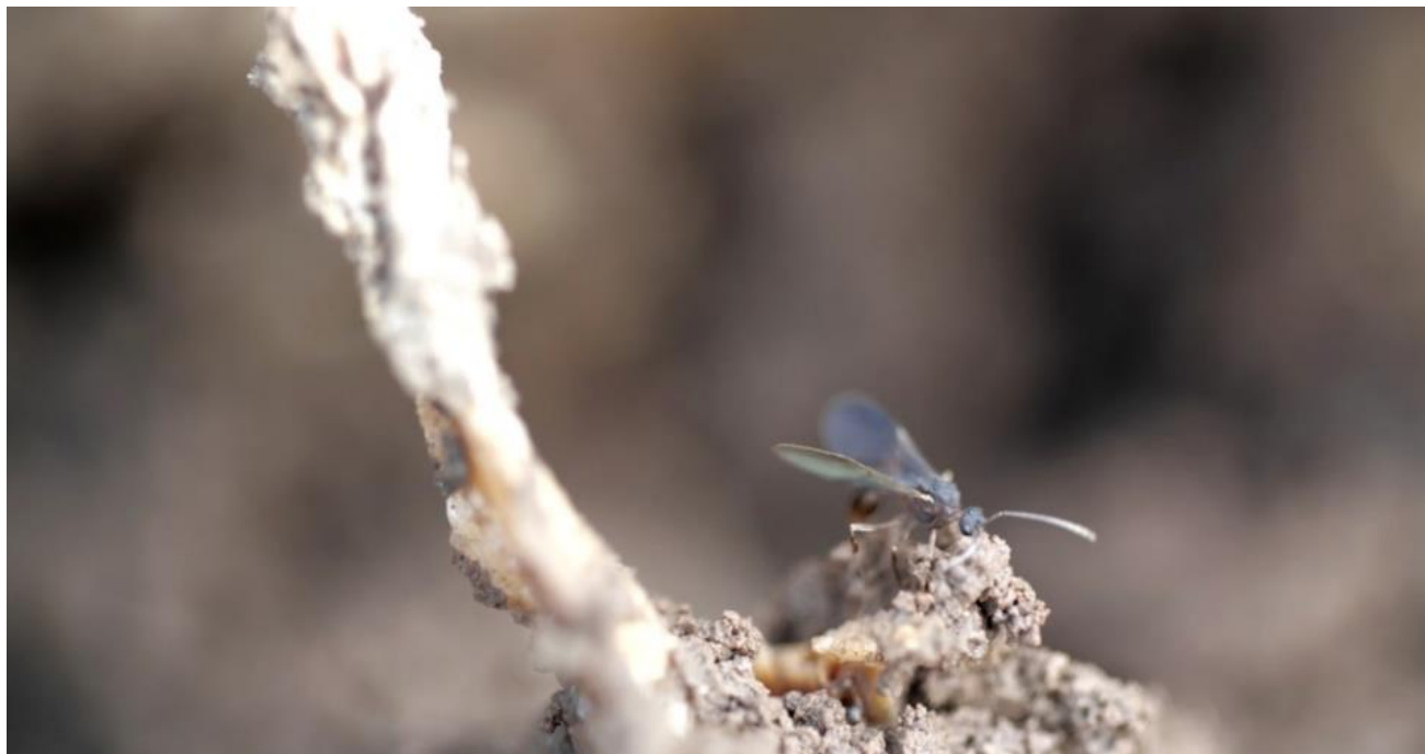
14 Maya WATANABE, Liminal , 2019