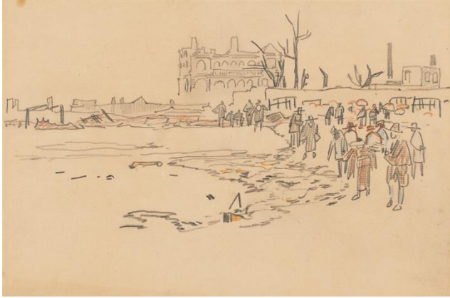
1 KANOKOGI Takeshiro, After the Great Kanto Earthquake (Refuges and Burnt Ruins) , 1923