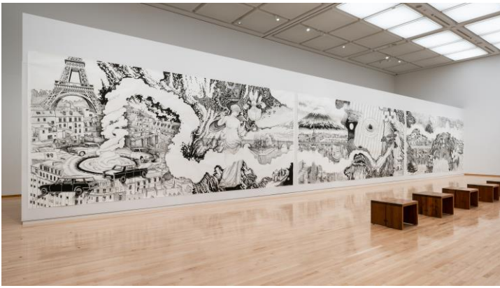
1 Oscar OIWA, Zeus, the God of Olympia , 2019 Collection of the Artist