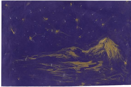
7 KOBAYASHI Masato, Flash #13 , 2005