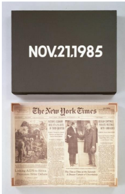
8 KAWARA On, NOV.21, 1985, from "Today" series, 1966-2013, 1985