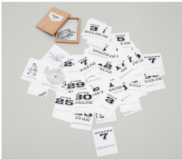
5 SHIOMI Mieko (Chieko), Spatial Poem No.3 "Falling Event - a fluxcalender" , 1968/1992