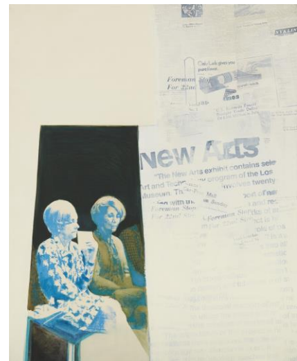
6 MISHIMA Kimiyo, [Title unknown], 1971

Contact Museum: Museum of Contemporary Art Tokyo Public Relations Mihoko Nakajima / Chiako Kudo E-MAIL: mot-pr@mot-art.jp TEL: +81-3-5245-1134 URL: https://www.mot-art-museum.jp/en