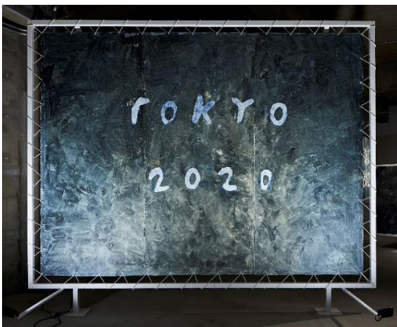
3 Chim ↑ Pom, May, 2020, Tokyo (Okubo Station) - Drawing a Blueprint - , 2020