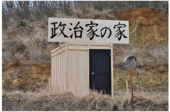
5. The House of Politicians , Minami Soma/FUKUSHIMA, 2012