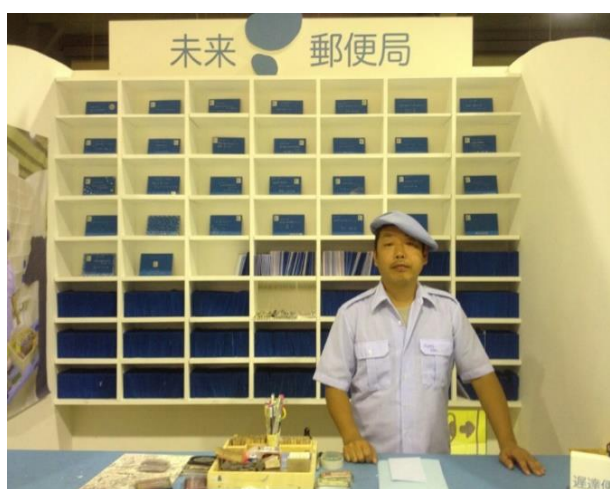
2. Future Post Office , Installation view at Shin Minatomura: A Small City for the Future, Yokohama Triennale 2011 Special Tie-Up Program (BankART Life III), 2011