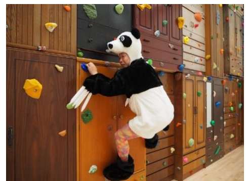
9. Useless Panda in Kiba

The artist is in the exhibition room every day, doing something (he can be absent occasionally). Something happens daily, and visitors can witness or participate in the events. Various activities, including 100 Teachers , which invites a hundred unique and interesting teachers to give a hundred unique classes during the exhibition, as well as talk events with collaborators from projects in Tohoku and Thank You Art Day , live performances, and workshops, are given in the exhibition room and the museum's premise every day, creating a place for movement, transformation, meeting, and conversation.