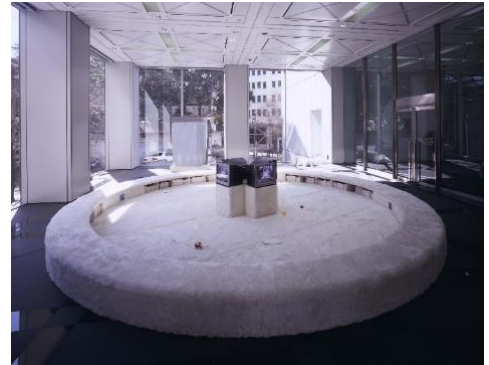
8. An Oasis for City - Dwellers , ZOOM ZEXEL ART SPACE/Tokyo, 2020.

A part of the exhibition gallery called Kaihatsu Town showcases a collection of unique facilities, such as a post office that delivers letters a year later, a bank that does not deal money, and a classroom that offers unusual classes. If you get tired, you can take a break in a faux fur park.