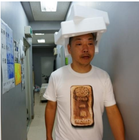
6. Portrait of the artist