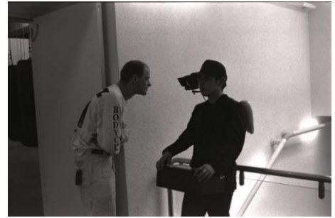
7. Performance at Documenta 9, 1992.

The exhibition introduces a number of photographs, videos, and actual materials of Kaihatsu's ambitious early-career activities, including those presented publicly for the first time, such as his guerrilla performance at Documenta 9 and 365 PROJECT , which traveled through Japan between 1995 and 1996.