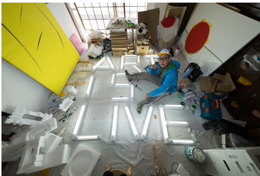
1. ART IS LIVE , 2024.

Museum of Contemporary Art Tokyo is pleased to present Yoshiaki Kaihatsu: ART IS LIVE—Welcome to One Person Democracy , the first major exhibition dedicated to Yoshiaki Kaihatsu (1966–) held at a museum in Tokyo. Since the beginning of his career in the 1990s, the artist has devoted himself to artistic activities that involve and provoke communication, with underlying interest in familiar events, such as everyday life and social occurrences.