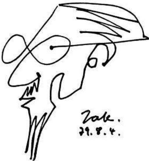
8 Self-Portrait Sketch, 1979 ©YOSIZAKA Takamasa

Contact: Museum of Contemporary Art Tokyo Public Relations Chiako Kudo / Aya Takahashi E-MAIL: mot-pr@mot-art.jp TEL: +81-3-5245-1134 URL: https://www.mot-art-museum.jp/en