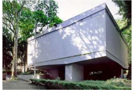
4 Japanese Pavilion, Biennial of Venice , 1956