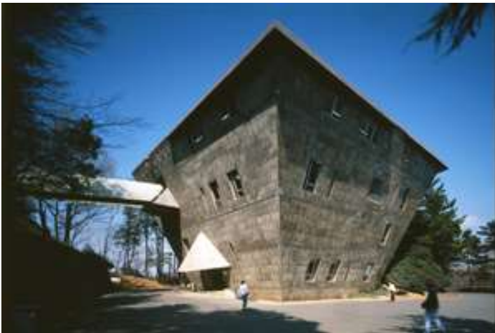
6 Inter-University Seminar House , 1965