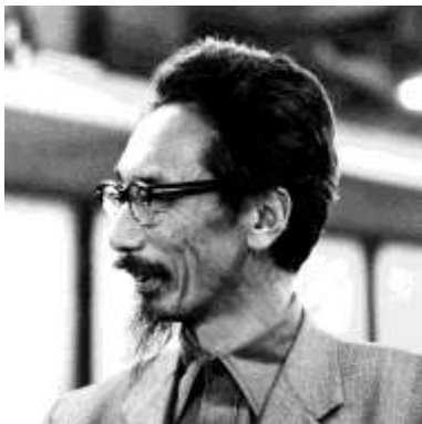
1 YOSIZAKA Takamasa

YOSIZAKA Takamasa was an architect who was active from the postwar reconstruction period until 1980. He studied under Wajiro Kon, known as the founder of "Modernology," and Le Corbusier, the maestro of modern architecture. YOSIZAKA's works include YOSIZAKA House , his personal residence built on an artificial ground*, Japan Pavilion, Biennial of Venice , which received the Minister of Education Award for Fine Arts, AIJ Prize-winning Athénée Français , and Inter-University Seminar House , which was selected and designated as Historical Architecture by the Tokyo Metropolitan Government to name a few. He is known for the unique architecture with its sculptural concrete forms.