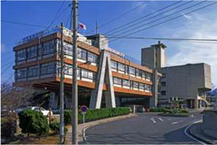
5 Gotsu City Hall , 1962