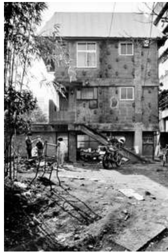
3 YOSIZAKA House , 1955