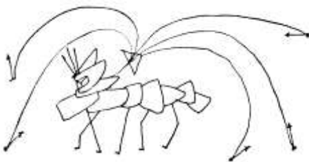
7 Dried Slug , 1966 ©YOSIZAKA Takamasa

The purpose of this exhibition is to reevaluate the works of YOSIZAKA Takamasa in the modern age. In 2015, the National Archives of Modern Architecture, Agency for Cultural Affairs, archived “YOSIZAKA Takamasa + Atelier U Architectural Fonds”, and in 2017, Waseda University collected his personal materials such as his diary, manuscripts, notebooks, documents, and photographs. As a result, archiving and restoration of his works is underway. This exhibition will display materials in various formats that decipher the secrets of YOSIZAKA's thoughts, ideas and creativity.