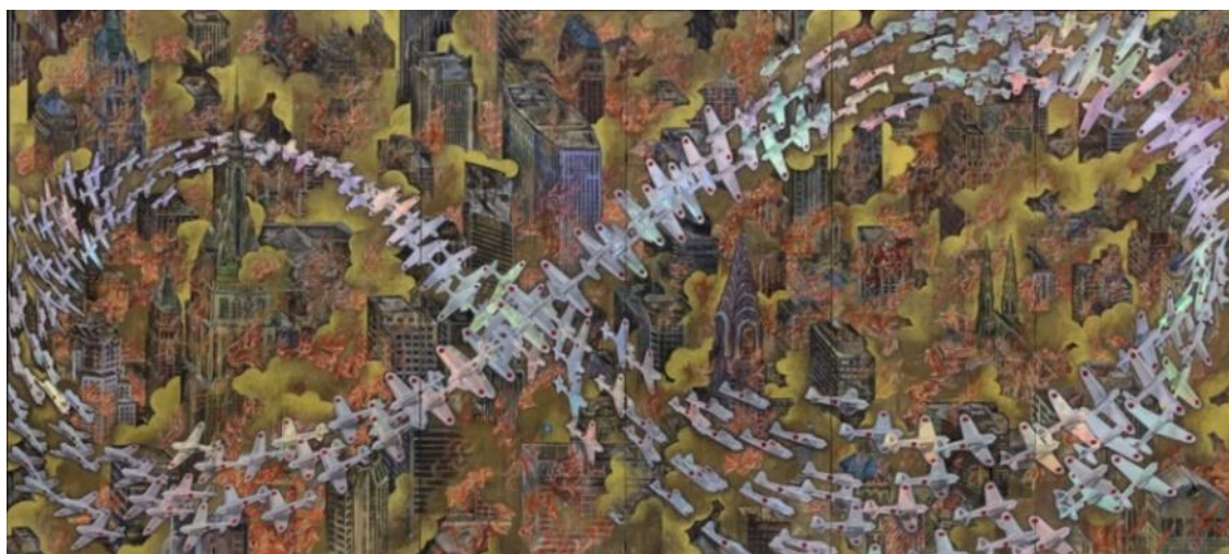
AIDA Makoto, A Picture of an Air-Raid on New York City (War Picture Returns) , 1996

Following the "neoteny japan – Takahashi Collection" exhibition in 2008 (at Kirishima Open-Air Museum/Kagoshima and others), exhibitions of the Takahashi Ryutaro Collection, which include numerous essential works especially of Japanese contemporary art since the 1990s, have been shown repeatedly at art museums in Japan and abroad. This show of selected items traces from one collector's "personal view" the path of the collection as it continued to change and develop, from its early days, via the period after the Great East Japan Earthquake, to the present day.