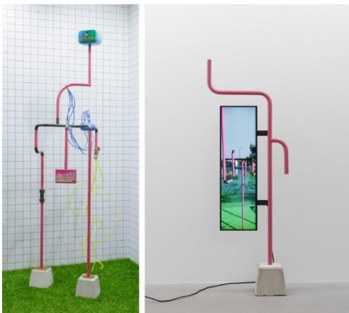
FUJIKURA Asako, Water Pipe Man - beach mark , 2023 L) H.220 × W.63 × D.75 cm / R) H.136 × W.45 × D.15 cm © Asako Fujikura, Courtesy of the artist and WAITINGROOM Photo: Shintaro Yamanaka (Qsyum!)