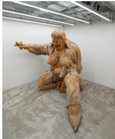
MORI Osamu, Jamboree - EP , 2014 H.385 × W.406 × D.365 cm © Osamu Mori, in courtesy of PARCEL Photo: Nobutada Omote