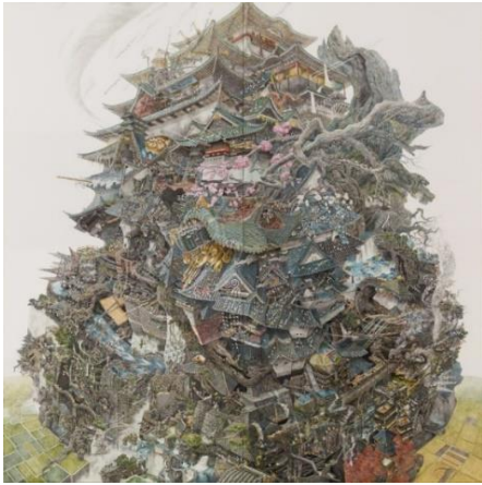
IKEDA Manabu, History of Rise and Fall , 2006 H.200 × W.200 cm © IKEDA Manabu, Courtesy of Mizuma Art Gallery Photo by Horiuchi Color Ltd.