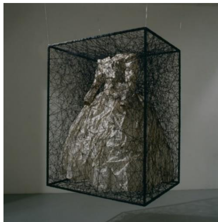
SHIOTA Chiharu, ZUSTAND DES SEINS , 2008 H.130 × W.100 × D.80 cm © JASPAR, Tokyo, 2024 and Chiharu Shiota Courtesy of Kenji Taki Gallery Photo: Tetsuo Ito