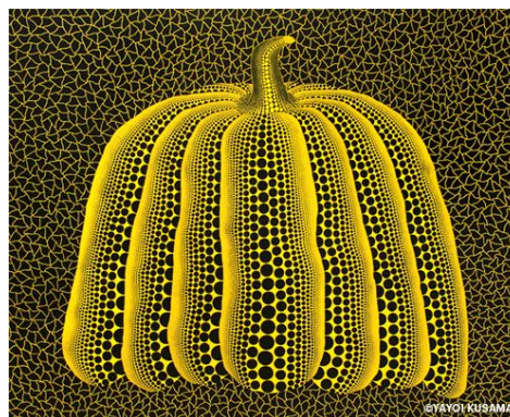
KUSAMA Yayoi, Pumpkin , 1990

As a collection that focuses mainly on Japanese contemporary art, the Takahashi Ryutaro Collection is one of the biggest of its kind in the world. Through a special selection of works, this exhibition aims to present an overview of the massive collection of over 3,500 items in total, and at once function as an introduction and definitive guide to Japanese contemporary art. Far superior to the average private art collection in terms of scale, the exhibition comprises dynamic displays that fill two entire floors of the Museum of Contemporary Art Tokyo.