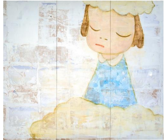
NARA Yoshitomo, Untitled , 1999

Outlining the maturing stage of the Takahashi Ryutaro Collection, this section focuses especially on works that depict human figures – one of the collection’s central themes. The desire to address all kinds of human aspects by way of art, and explore the roots of creativity, is an undercurrent that continues to inform the endeavors of the collector and psychiatrist, TAKAHASHI Ryutaro. Exhibits range from renowned works – somewhat the collection’s trademarks – to the most recent creations of young artists.