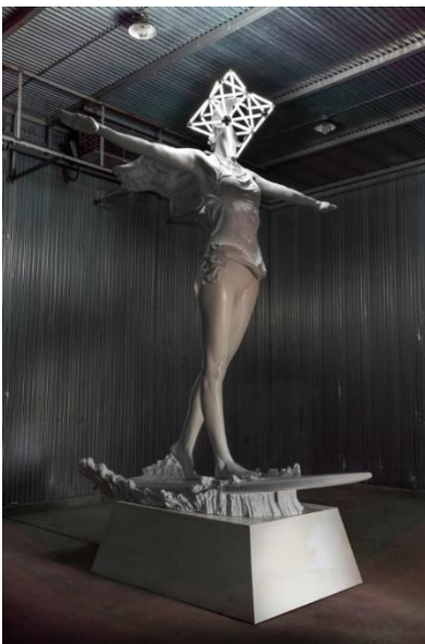
ODANI Motohiko, Surf Angel (Provisional Monument 2) , 2022

H.560 × W.423 × D.376 cm © ODANI Motohiko