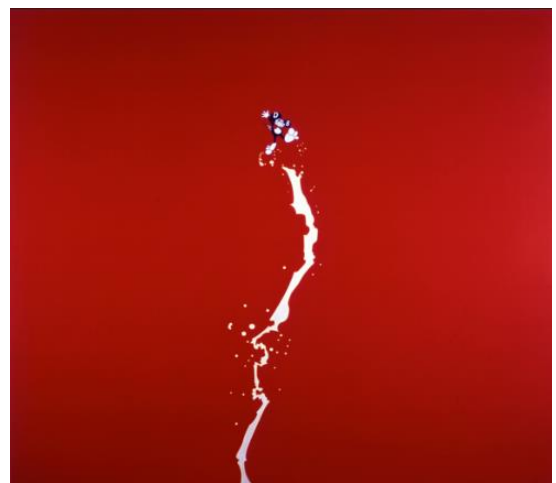
MURAKAMI Takashi, ZuZaZaZaZaZa , 1994 H.150 × W.170 × D.7.5 cm © 1994 Takashi Murakami/ Kaikai Kiki Co., Ltd. All Rights Reserved.