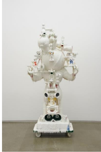
KANEUJI Teppei, White Discharge (Built-up Objects #21) , 2012 H.168 × W.84 × D.55 cm