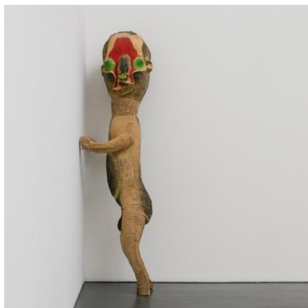
KATO Izumi, Untitled , 2004 H.205 × W.56 × D.52 cm © 2004 Izumi Kato Courtesy of the artist Photo: Yusuke Sato

Please add Takahashi Ryutaro Collection at the end of each credit line.