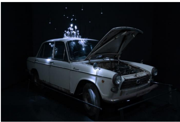
AOKI Mika, Her songs are floating , 2007 H.170 × W.380 × D.150 cm Installation view of the exhibition "Born in HOKKAIDO" at the Hokkaido Museum of Modern Art, 2007.