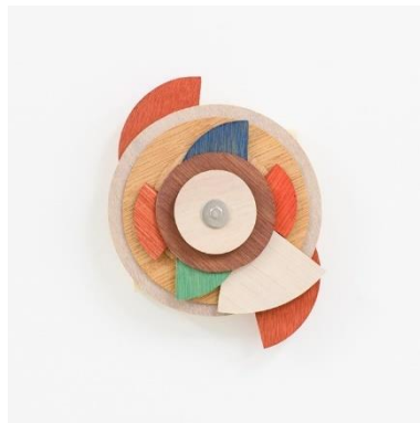
16. The Copernican Theory 2020 Aere , 2020, Private Collection.