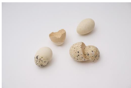
8. Restoration-Fabrication, 2003-2006, Collection of the artist.