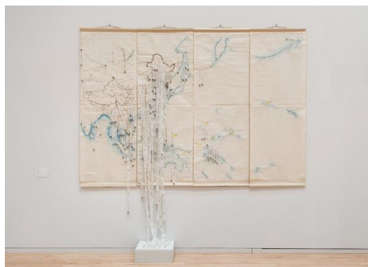
12. Precedent , 2015, Photo: Masaru YANAGIBA (Installation view, Museum of Contemporary Art Tokyo, 2019)