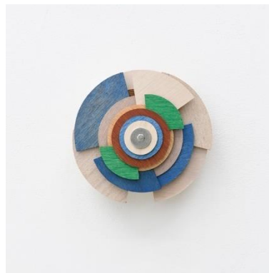
17. The Copernican Theory 2020 Noru , 2020, Collection of Mr. Shunichiro Oka.