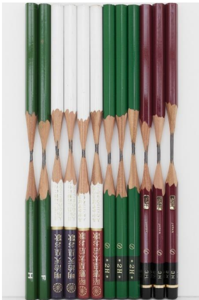
1. Pencil , 1996, Museum of Contemporary Art Tokyo.

Museum of Contemporary Art Tokyo is pleased to announce Yasuko Toyoshima: Origination Method , the first major museum exhibition dedicated to the artist's works. For over 30 years since 1990, Yasuko Toyoshima (1967–) has kept the perspective of "I" and continually confronted, in her own ways, various systems, values, and rules that surround us. Toyoshima leverages her interests and feelings of alienation to reexamine and reinterpret the frameworks and rules that govern our thoughts and actions—from the mechanisms of objects and tools, school education, and economic activities to various everyday actions—which we have inevitably internalized and automated. By doing so, she questions how human thought patterns, society, and the self are formed.