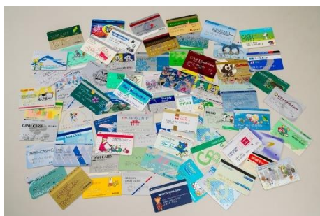
2. Open Bank Account , 1996-, Collection of the artist.