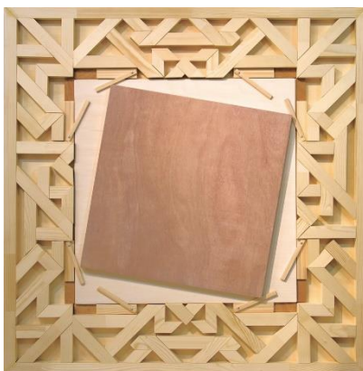
4. Panel #32, 2014, Private collection.