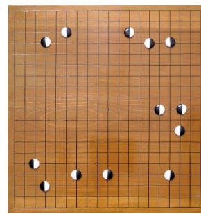
5. The Professional GO Players' Championship Series , 1992, Collection of the artist.