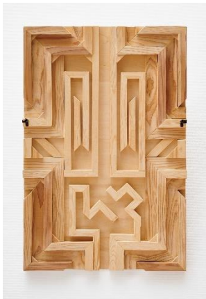
10. Panel #22 , 2014, Collection of the artist.