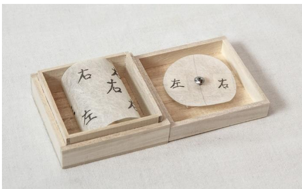
13. Rotation (Left, Right) , 2018, M-gallery. Photo: Yasuko TOYOSHIMA