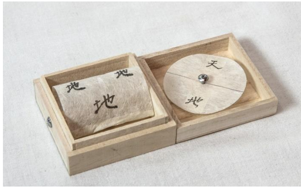
14. Rotation (Up, Down) , 2018, M-gallery.