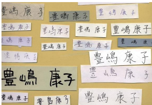
7. Script Horizontal #1 , 1999-, Collection of the artist