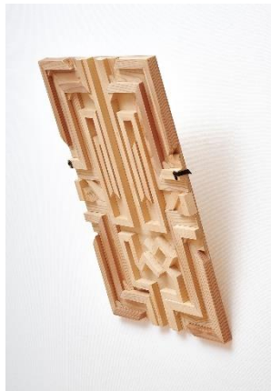
11. Panel #22 , 2014, Collection of the artist.