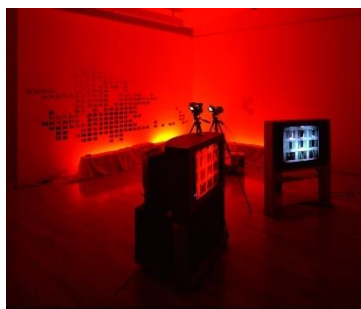
3. Color Compensation 1 , 2005-, Collection of the artist. Photo: Mitsuru GOTO (Open Studio Program at Fuchu Art Museum 2005)