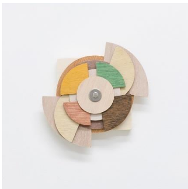
15. The Copernican Theory 2020 Nalgae , 2020, Collection of the artist.