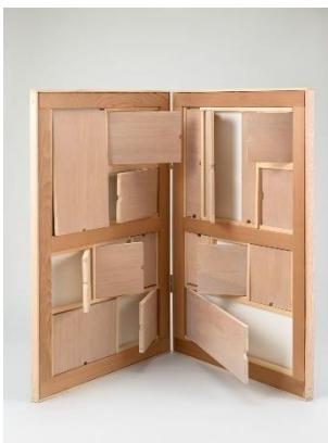
9. Cover-up Maneuvering 20120625 , 2012, Museum of Contemporary Art Tokyo.