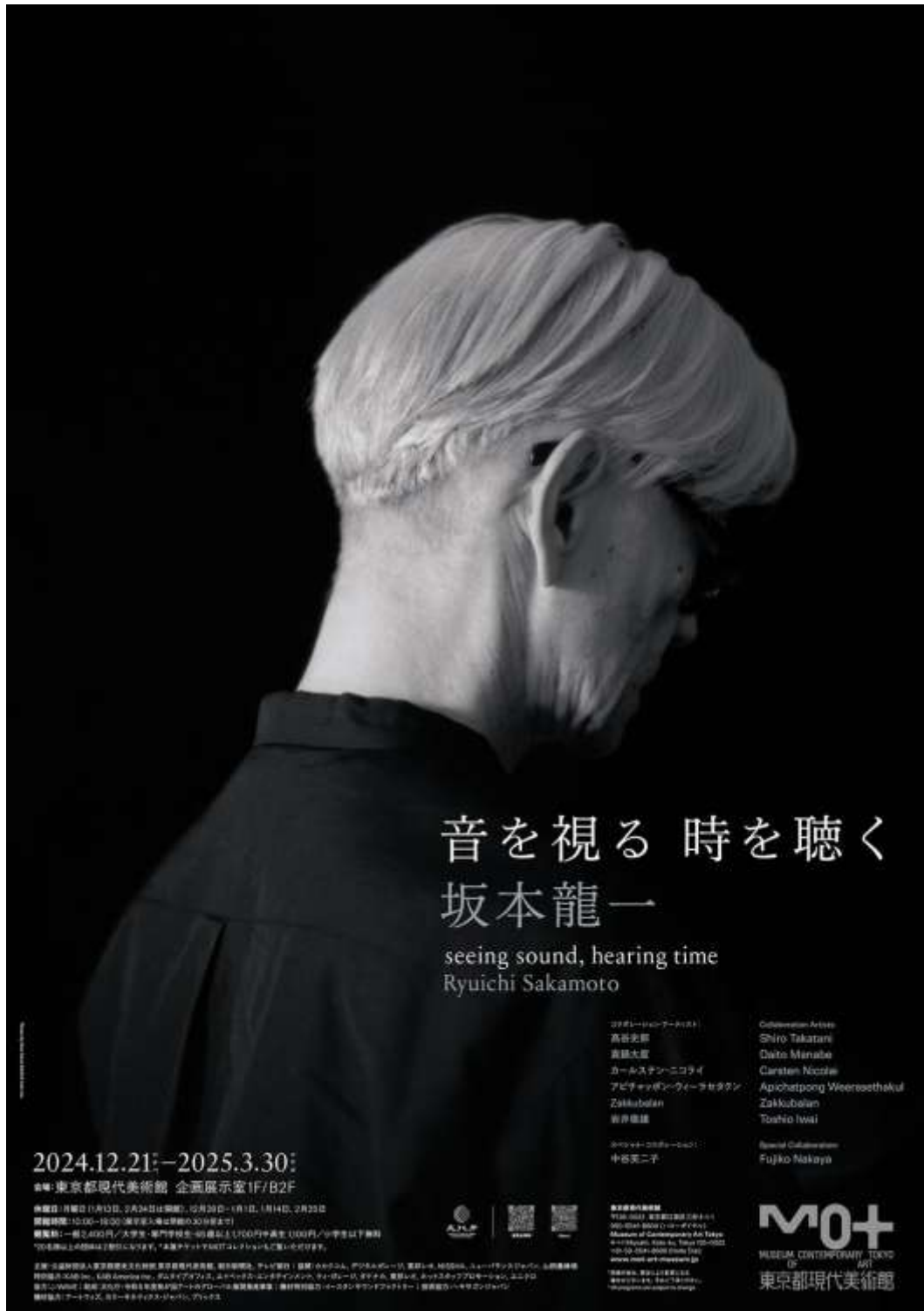
01 Ryuichi Sakamoto | seeing sound, hearing time – Exhibition Poster

Contact Museum of Contemporary Art Tokyo Public Relations / Kudo, Inaba, Uchibori, Nogawa E-MAIL: mot-pr@mot-art.jp TEL: +81-3-5245-1134 https://www.mot-art-museum.jp/en * All Programs are subject to change.