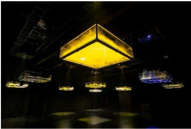
03 Ryuichi Sakamoto + Shiro Takatani, LIFE–fluid, invisible, inaudible... , 2007/2023, installation view of “Ryuichi Sakamoto | SOUND AND TIME” at M WOODS (People’s park), Chengdu, 2023