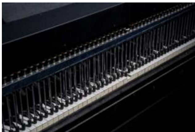
02 Ryuichi Sakamoto with Shiro Takatani, IS YOUR TIME , 2017/2023, installation view of "Ryuichi Sakamoto | SOUND AND TIME" at M WOODS (People's park), Chengdu, 2023

Carsten Nicolai, PHOSPHENES, ENDO EXO , 2024 Music: Ryuichi Sakamoto