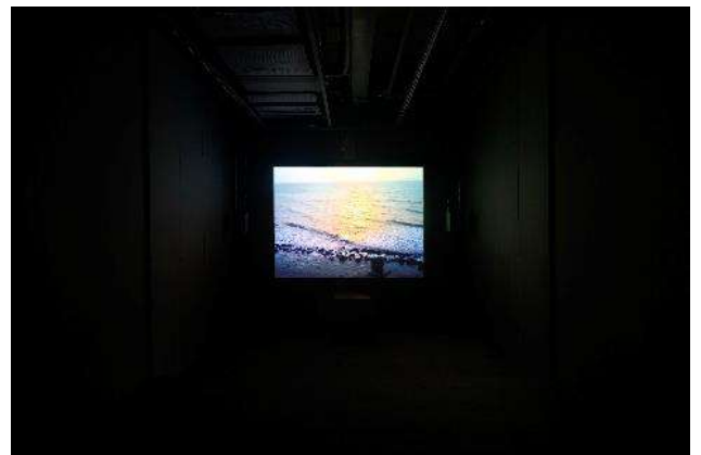
06 Ryuichi Sakamoto + Apichatpong Weerasethakul, async–first light , 2017, installation view of “Ryuichi Sakamoto | SOUND AND TIME” at M WOODS (People’s park), Chengdu, 2023