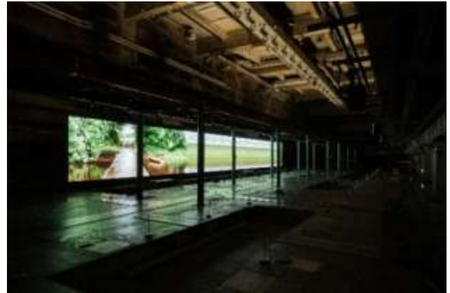
04 Ryuichi Sakamoto + Shiro Takatani, async–immersion 2023, 2023, installation view of “AMBIENT KYOTO 2023”, Kyoto Shimbun Building B1 floor, 2023.