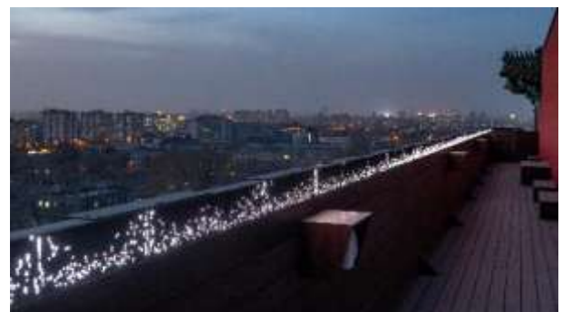
07 Ryuichi Sakamoto + Daito Manabe, Sensing Streams 2021–invisible, inaudible , 2021, installation view of “seeing sound, hearing time” at M WOODS HUTONG, Beijing, 2021.

Sensing Streams 2024–invisible, inaudible (MOT version) 2024