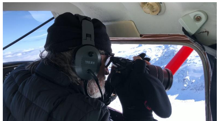
4 Olafur Eliasson photographing The glacier melt series 1999/2019 , 2019 in Reyjavik.

Contact Media Inquiries about the Exhibition: Yoshiko Nawa E-MAIL: info@relayrelay.net Inquiries about the Museum: Museum of Contemporary Art Tokyo Public Relations Mihoko Nakajima / Chiako Kudo E-MAIL: mot-pr@mot-art.jp TEL: +81-3-5245-1134 URL: https://www.mot-art-museum.jp/en