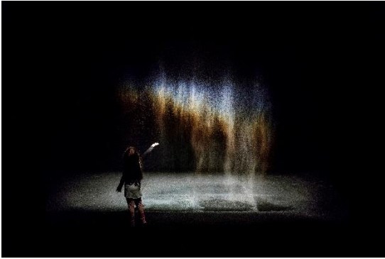
1 Olafur Eliasson, Beauty , 1993 Installation view: Moderna Museet, Stockholm 2015 Photo: Anders Sune Berg Courtesy of the artist; neugerriemschneider, Berlin; Tanya Bonakdar Gallery, New York / Los Angeles © 1993 Olafur Eliasson

For his solo exhibition at MOT, Eliasson presents several new works, including two major installations that are located inside and outside the museum, photographic series, and documentation from several of Eliasson's interventions in public space. The exhibition features several experiential artworks and installations, such as Eliasson's key early work "Beauty" (1993).