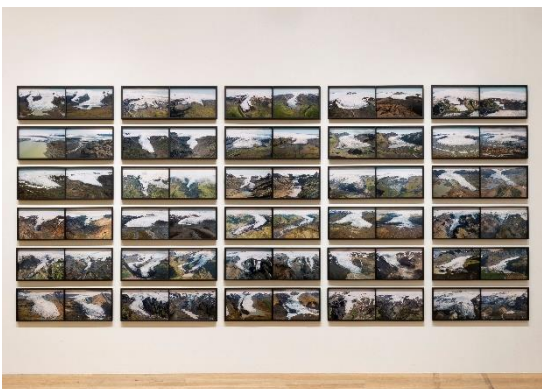
3 Olafur Eliasson, The glacier melt series 1999/2019 , 2019 Courtesy of the artist; neugerriemschneider, Berlin; Tanya Bonakdar Gallery, New York / Los Angeles © 2019 Olafur Eliasson Photo: Michael Waldrep / Studio Olafur Eliasson

Eliasson has photographed the Icelandic landscape for more than two decades. "The glacier melt series 1999/2019" (2019) is irrefutable proof of the changes in Iceland's glacier ice masses over the last 20 years.