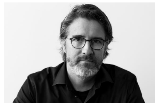
6 Portrait of Olafur Eliasson

Visit olafureliasson.net ; soe.tv ; studiootherspaces.net ; or littlesun.com or follow @olafureliasson on Twitter; @studiolafureliasson and @soe_kitchen on Instagram; and @studiolafureliasson on Facebook.