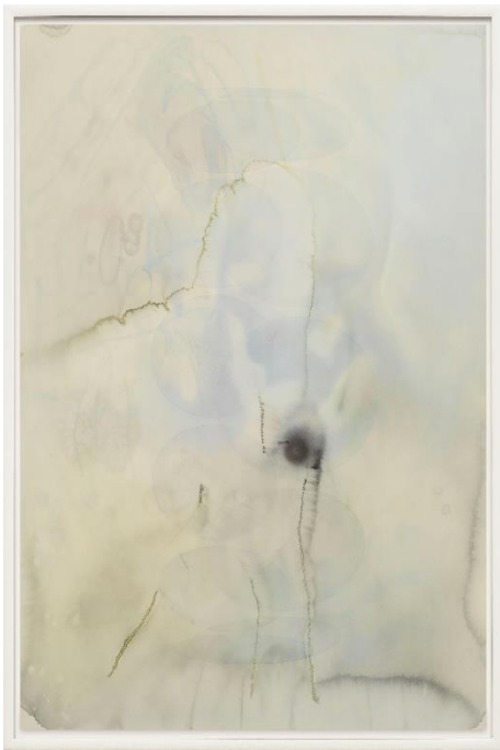
7 Olafur Eliasson, Methane matter, 2019