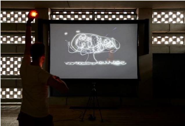
5 Olafur Eliasson, Sunlight graffiti , 2012 Installation view: Tate Modern, London Photo: Zan Wimberley, 2019 Courtesy of the artist; neugerriemschneider, Berlin; Tanya Bonakdar Gallery, New York / Los Angeles

From the use of solar-powered lights to his efforts to reduce carbon dioxide emissions from the transportation of artworks, Eliasson addresses in this exhibition the urgent need to act on the global climate crisis. "Sunlight Graffiti" (2012) invites visitors to create drawings with sunlight stored in Eliasson's Little Sun solar-powered lamps. The activities of Studio Olafur Eliasson are not limited to the production of artworks. They also encompass a variety of experiments carried out on a daily basis that tackle design and architectural questions as well as research into new materials. The exhibition will display the studio's research into new sustainable and biodegradable materials and recycling techniques.