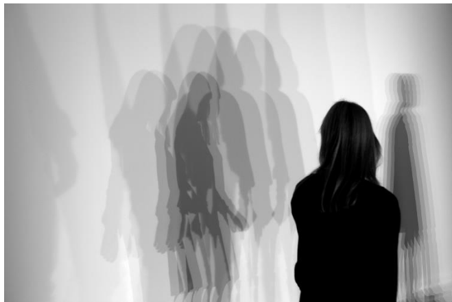
8 Olafur Eliasson, Slow-motion shadow, 2009 Installation view: 21st Century Museum of Contemporary Art, Kanazawa, Japan, 2009-2010 Courtesy of the artist; neugerriemschneider, Berlin; Tanya Bonakdar Gallery, New York / Los Angeles