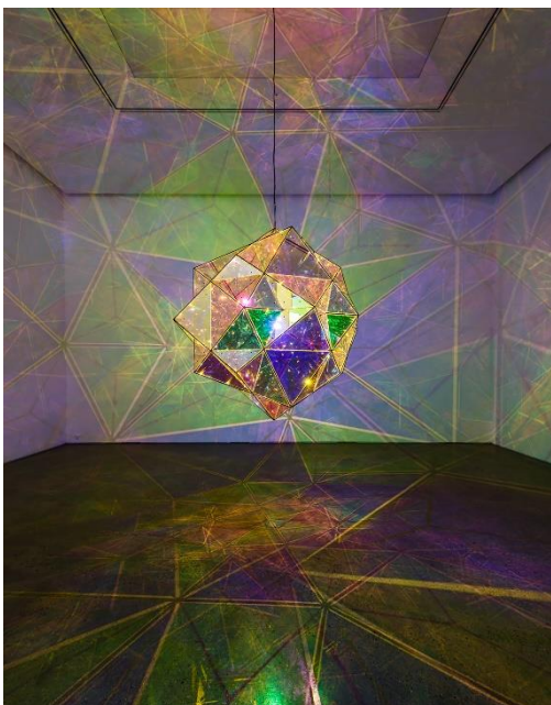
9 Olafur Eliasson, The exploration of the centre of the sun , 2017 Installation view: PKM Gallery, Seoul, 2017 Photo: Jeon Byung Cheol, 2017 Courtesy of the artist and PKM Gallery, Seoul © 2017 Olafur Eliasson