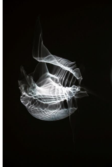
2 Test for new work for Olafur Eliasson: Sometimes the river is the bridge, 2019