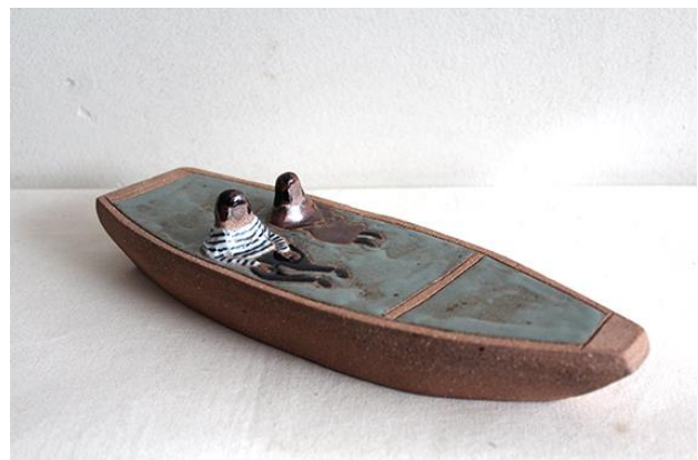
4 Wataridori Keikaku, Boat , 2020

Contact Museum: Museum of Contemporary Art Tokyo Public Relations Mihoko Nakajima / Chiako Kudo E-MAIL: mot-pr@mot-art.jp TEL: +81-3-5245-1134 URL: https://www.mot-art-museum.jp/en