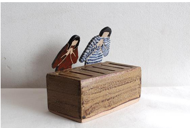
3 Wataridori Keikaku, Visit to the shrine , 2020