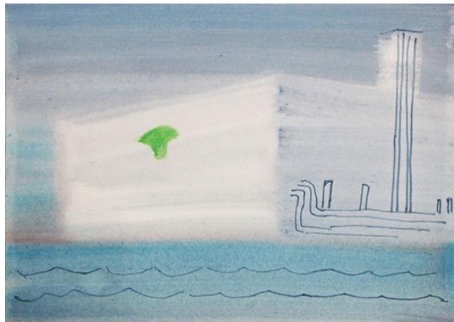
2 Akiko Takeuchi, Cloudy sky above the drainage pump station , 2020