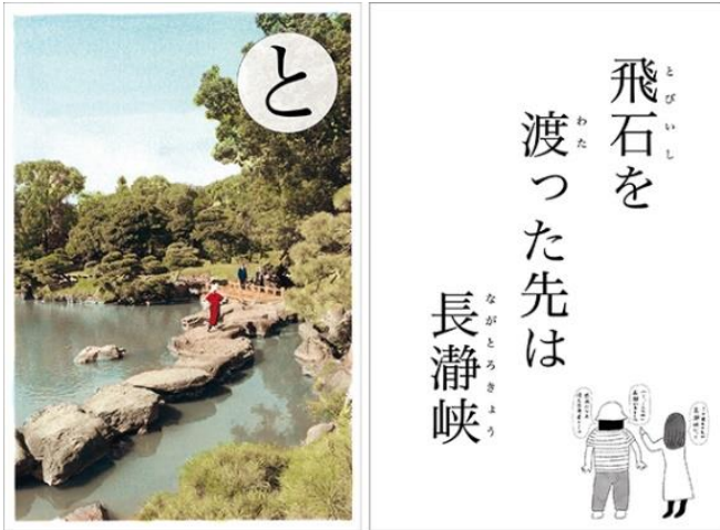
5 Wataridori Keikaku, Hand-colored Fukagawa Journey Karuta: to , 2020