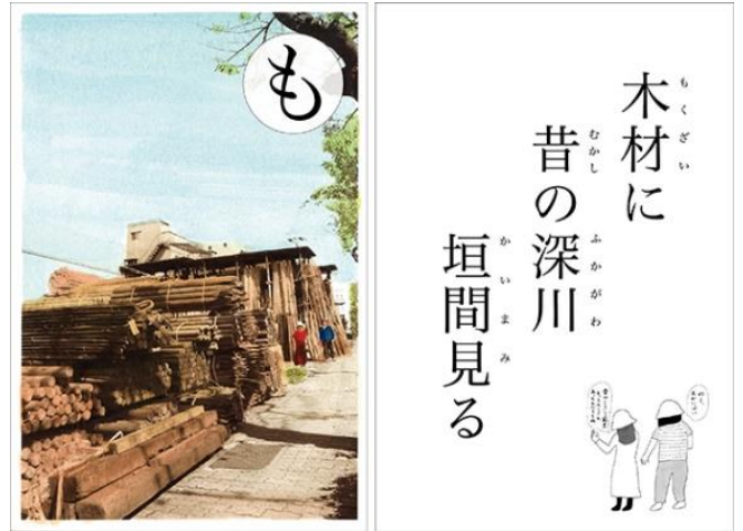
6 Wataridori Keikaku, Hand-colored Fukagawa Journey Karuta: mo , 2020