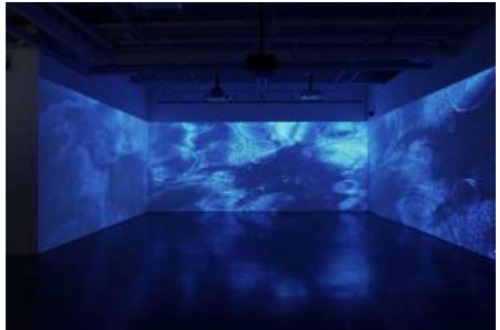
08 Soundwalk Collective & Patti Smith 'Correspondences' - kurimanzutto NY (installation view)