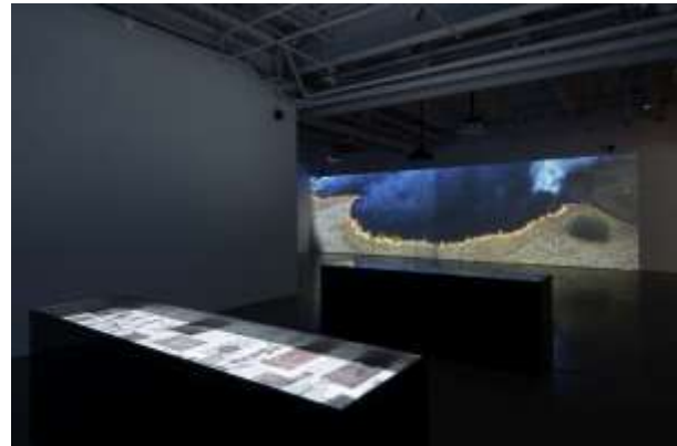
05 Soundwalk Collective & Patti Smith 'Correspondences' - kurimanzutto NY (installation view), courtesy of kurimanzutto