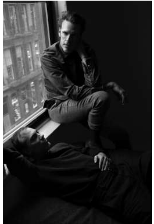
09 Photo by Vanina Sorrenti B

Soundwalk Collective have performed and exhibited at a diverse range of arts and music institutions, such as BAM, CCB Lisbon, Centre Pompidou, CTM Festival, documenta, KW Institute of Contemporary Art, Louvre Abu Dhabi, Manifesta, Mobile Art Pavillion by Zaha Hadid, New Museum, Reethaus, TPMM Tbilisi and Volksbühne Berlin.