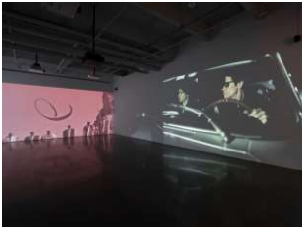
07 Soundwalk Collective & Patti Smith 'Correspondences' - kurimanzutto NY (installation view)

The videos in this exhibition include edits of rare, previously unreleased footage from films such as Andrei Tarkovsky's Andrei Rublev , Pier Paolo Pasolini's Medea (in which Maria Callas plays the tragic heroine from Greek mythology), Abel Ferrara's Pasolini (which depicts the final day of the murdered Italian master Pier Paolo Pasolini), as well as NASA satellite imagery, ocean data visualized through collaboration with the research foundation TBA21-Academy, and the voice of Jean-Luc Godard.