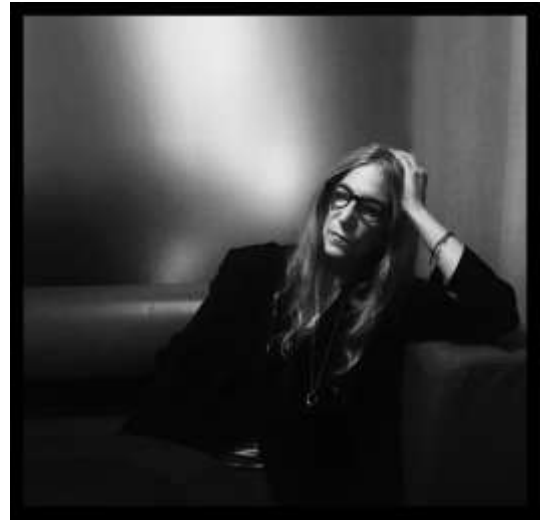
10

May 21, 2022, she received the French Legion of Honor for her life's work.