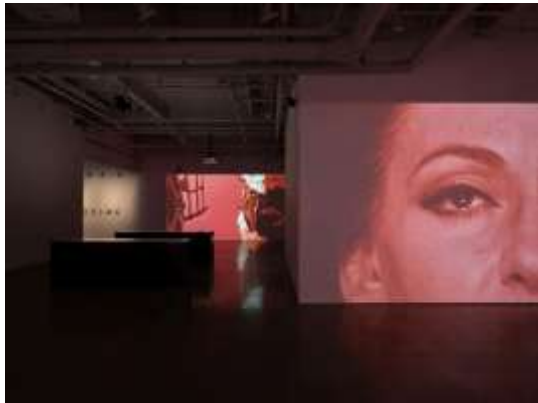
04 Soundwalk Collective & Patti Smith 'Correspondences' - kurimanzutto NY (installation view)