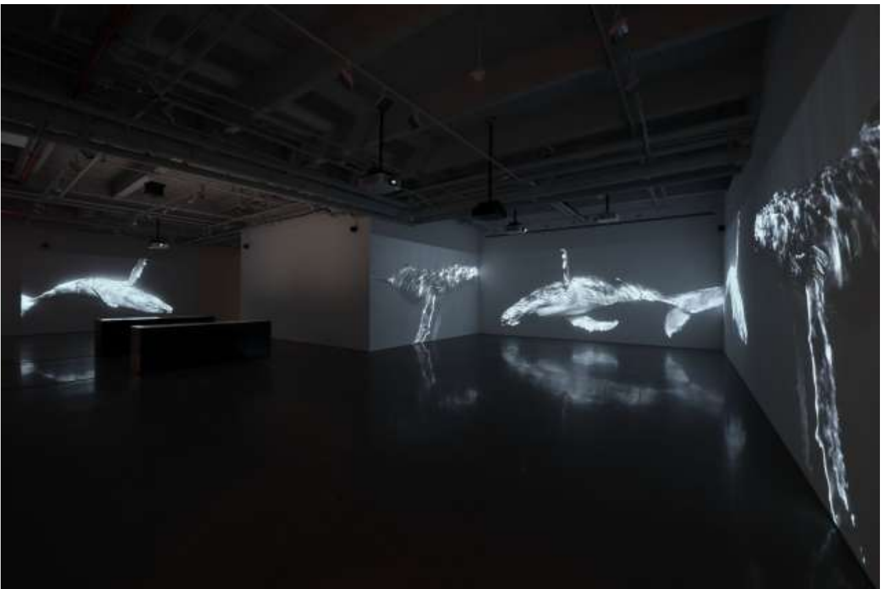
03 Soundwalk Collective & Patti Smith 'Correspondences' - kurimanzutto NY (installation view), courtesy of kurimanzutto

CORRESPONDENCES is a collaborative project between Soundwalk Collective and Patti Smith, born from a dialogue spanning more than a decade. This ongoing and ever-evolving collaboration evokes the 'sonic