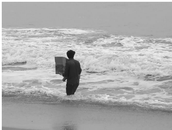
4 Ishu Han, Wave Harvesting , 2021