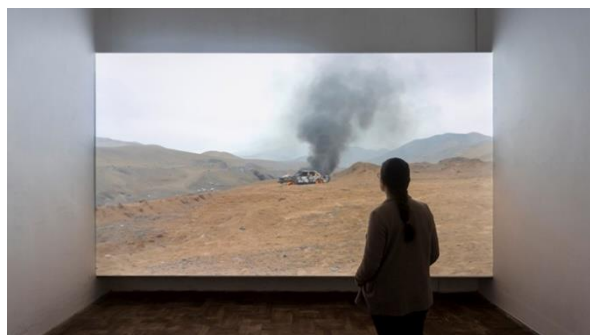
6 Maya Watanabe, Sceneries II , 2016 Installation view