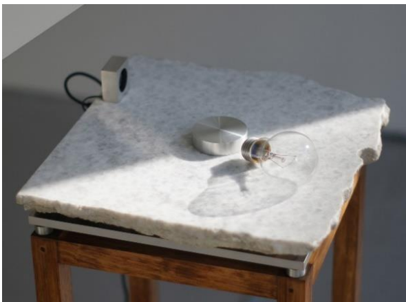
1 Junya Kataoka, Spinning Light Bulb #4 Arare , 2019

Recent major solo Exhibitions are “As the inevitable spin of a light bulb and a fan on a marble slab” (Kana Kawanishi Gallery, 2019) and “Big Two-Hearted River” (3331 Arts Chiyoda, 2019) , “Under35 Junya Kataoka + Rie Iwatake” (BankART studio NYK, 2017) . Recent major group Exhibitions are “Metamorphosis, Perceptions of the Passage of Time” (Fujisawa City Art Space, 2020), “Trans_2018-2019” (Akiyoshidai International Art Village, Yamaguchi, 2019), “Art and Glasses Road Show” (Kamata_Soko, 2018) and “Pyeongchang Biennale 2017” (Gangneung, South Korea).