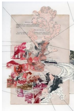
2 Rie Iwatake, Bodyscapes # muscles of the face , 2018

Contact Museum: Museum of Contemporary Art Tokyo Public Relations Mihoko Nakajima / Chiako Kudo E-MAIL: mot-pr@mot-art.jp TEL: +81-3-5245-1134 URL: https://www.mot-art-museum.jp/en