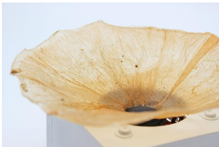
3 Yoko Shimizu, Biospeaker , 2017

Yoko Shimizu (1977-) creates artworks using the mechanisms of nature, life, and the universe, visualizing the beauty of the micro phenomena of microorganisms, cells, DNA, and organic compounds, and the macro phenomena of plants, nature, and the entire Earth. Some of her best-known works include Cycles of Life , in which microorganisms form colonies that emerge, proliferate and deteriorate on colorful medium, and Photosyntheograph , in which the artist uses photosynthesis to create high-resolution graphic prints on plants. Recent major solo exhibitions include the "Biodesign Lab Exhibition" (NARS Foundation, New York, 2019), "Layers of Life" (LAD GALLERY, 2017), and "The Clean Room" (LAD GALLERY, 2015). Recent major group exhibitions include "India Design ID" (New Delhi, India, 2019), "Link of Life" (Shiseido Gallery, 2017), and "Ars Electronica Festival" (Linz, Austria, 2016). Since 2020, she is an artist and researcher at the Ars Electronica Futurelab in Linz, Austria.