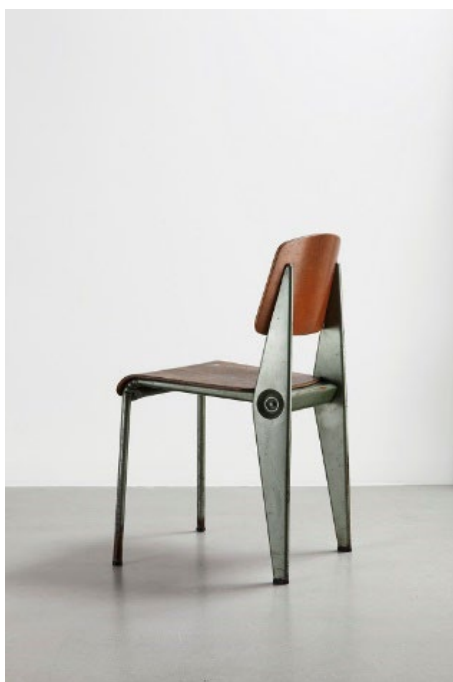
Jean Prouvé Cafétéria n° 300 demountable chair, ca. 1950

Prouvé's work, which explored aluminum and steel as materials for transportable furniture and architecture, as well as developing new technologies of foldable chairs and prefab architecture, encompassed multiple fields of design, craft, and architecture. His works largely impacted architecture and industrial design in the 20th century, including those of Jean Nouvel and Renzo Piano. This exhibition provides a comprehensive introduction to Prouvé's work by presenting his original works, drawings, and other materials that still remain today.