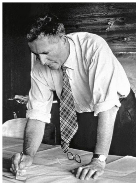
Jean Prouvé in his office at the Ateliers Jean Prouvé, Maxéville, ca. 1955

From July 16 (Sat) to October 16 (Sun), 2022, the Museum of Contemporary Art Tokyo will hold a large-scale exhibition of Jean Prouvé (1901-1984) to introduce his highly acclaimed oeuvre. Born in Paris in 1901 to a painter and a musician, Prouvé began his career as a metalworker under the influence of the Nancy School, a branch of Art Nouveau that sought to fuse industry and art. He opened his first workshop in 1923 and later expanded his work from furniture to architecture, working with Le Corbusier, Charlotte Perriand and others.