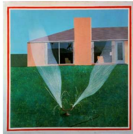
5. A Lawn Sprinkler , 1967, Acrylic on canvas, 125.8 x 123.8 cm, Museum of Contemporary Art Tokyo © David Hockney