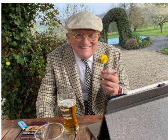
6. David Hockney in Normandy, April 1st 2021

The exhibition DAVID HOCKNEY , held at the Museum of Contemporary Art Tokyo is the largest ever solo exhibition in Asia devoted to the British artist David Hockney (b. 1937 in Bradford, UK) who is regarded as one of the most innovative artists of the postwar era. Hockney has produced diverse works in a variety of fields including painting, drawing, print work, photography, and stage design for over 60 years and recently made pictures of familiar subjects using the iPad. This large scale exhibition of over 100 selected works includes a number of the artist's early works produced in the California in the 1960s, a series of recent large paintings of his native Yorkshire landscape and a 90 meters-long new work he drew in Normandy during the lockdown period for COVID-19.