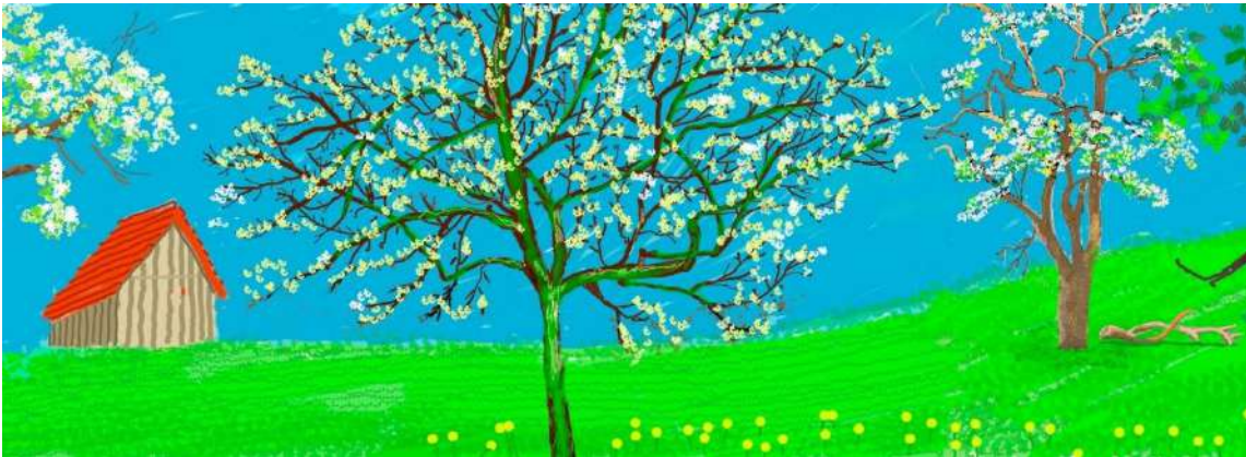
2. A Year in Normandie 2020-2021 (detail), 2020-21, Composite iPad painting, 100 x 9000 cm, Collection of the artist