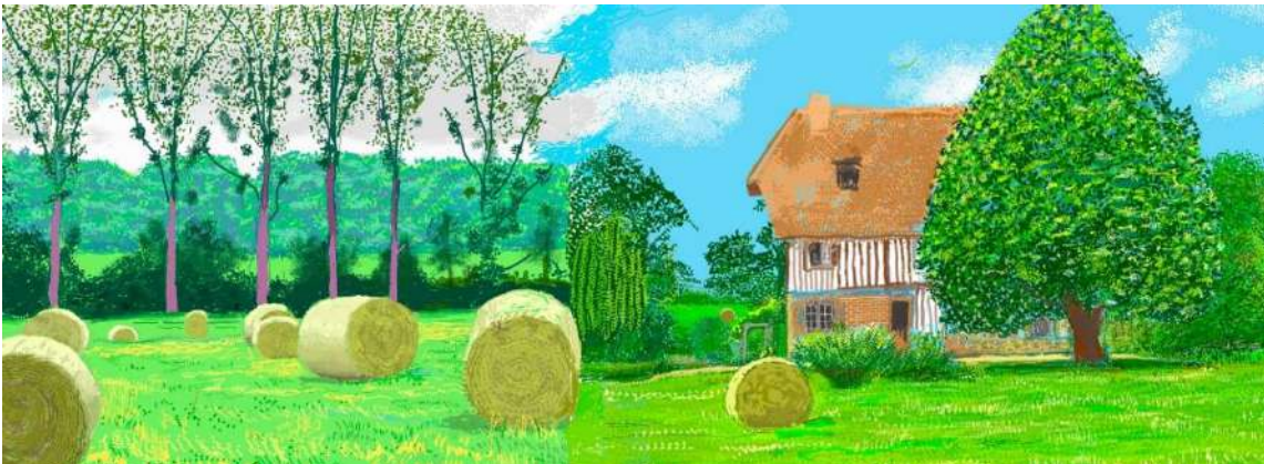
3. A Year in Normandie 2020-2021 (detail), 2020-21, Composite iPad painting, 100 x 9000 cm, Collection of the artist © David Hockney