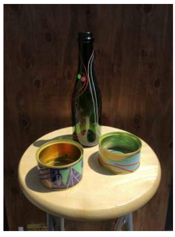
6. Reference Image