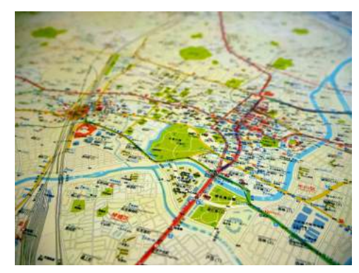
1. Takayuki Imaizumi, Imaginary Map, Nagomuru City, 2018 (detail)

Takayuki Imaizumi (b.1985) lives and works in Tokyo. He has created imaginary maps (maps of nonexistent cities) from the age of seven, and currently continues to work as a cartographer of fictional realms and imagined situations. Imaizumi attempts to read into and understand people's everyday lives and actions through maps, and explores new ways of looking at cities.