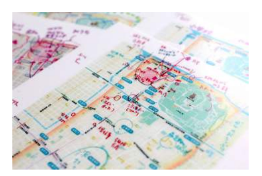
4. Ayako Sato, Personal Memory Mapping – Uemachi Plateau, 2013(detail)

Ayako Sato studied architecture and informatics engineering, and engages in research and concept design that centers on dialogue. While working on several projects since 2010 such as "mogu book," "traveling bookshelf," and "card dialogue," she continues to explore mediating means of communication and processes of verbalization.