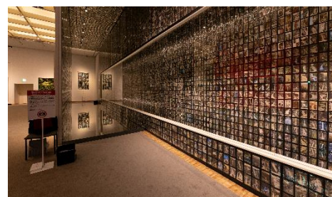
[Reference photo] “Waterfall Installation” at Aichi Prefectural Museum of Art

The exhibits also include works from “WITH CORONA” series, which are scattered throughout the museum. Yokoo has been posting the “WITH CORONA” series, a collage of his works or photos with a mask motif, on Twitter and his blog since May, 2020.