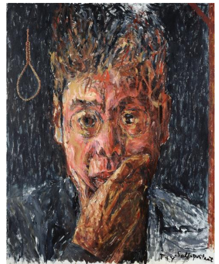
Tadanori Yokoo, T+Y Self-portrait , 2018 Private Collection

Yokoo has been depicting the “realm of imagination” (幻境, pronounced “genkyo”) as a wildly splendid world of images that draw from the “original homeland” (原郷, also pronounced “genkyo”) of all human souls. The exhibition will be an opportunity for witnessing the “present state” (現況, again pronounced “genkyo”) of Tadanori Yokoo’s art.