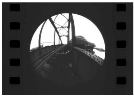
5. Hiroshi Shimura Near the Koto Sunamachi Canal Railway Bridge 1968