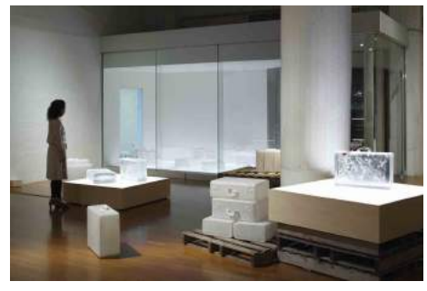
2. Aiko Miyanaga Letter (detail) 2013 photo by KIOKU Keizo © MIYANAGA Aiko Courtesy Mizuma Art Gallery