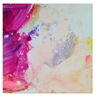
4. Chika Higashi Paper Palette 2018