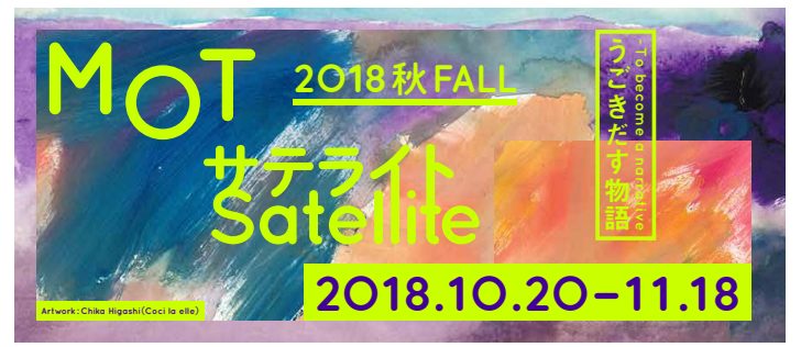
8. MOT Satellite 2018 FALL - To become a narrative Main image