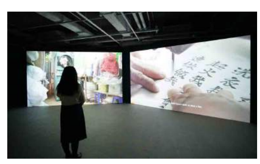
Yeondoo Jung A Girl in Tall Shoes 2018