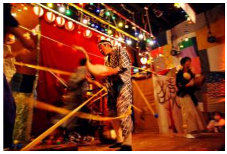
7. Tetsuwari Albatrossket