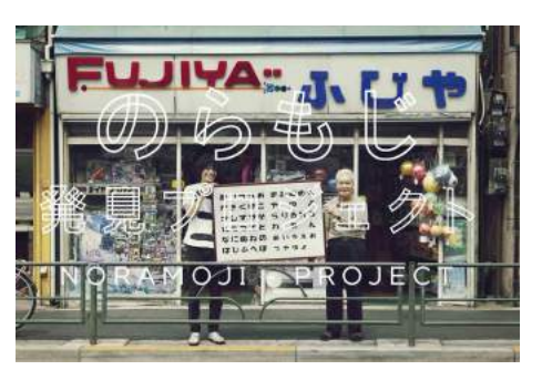
6. Noramoji Project 2013