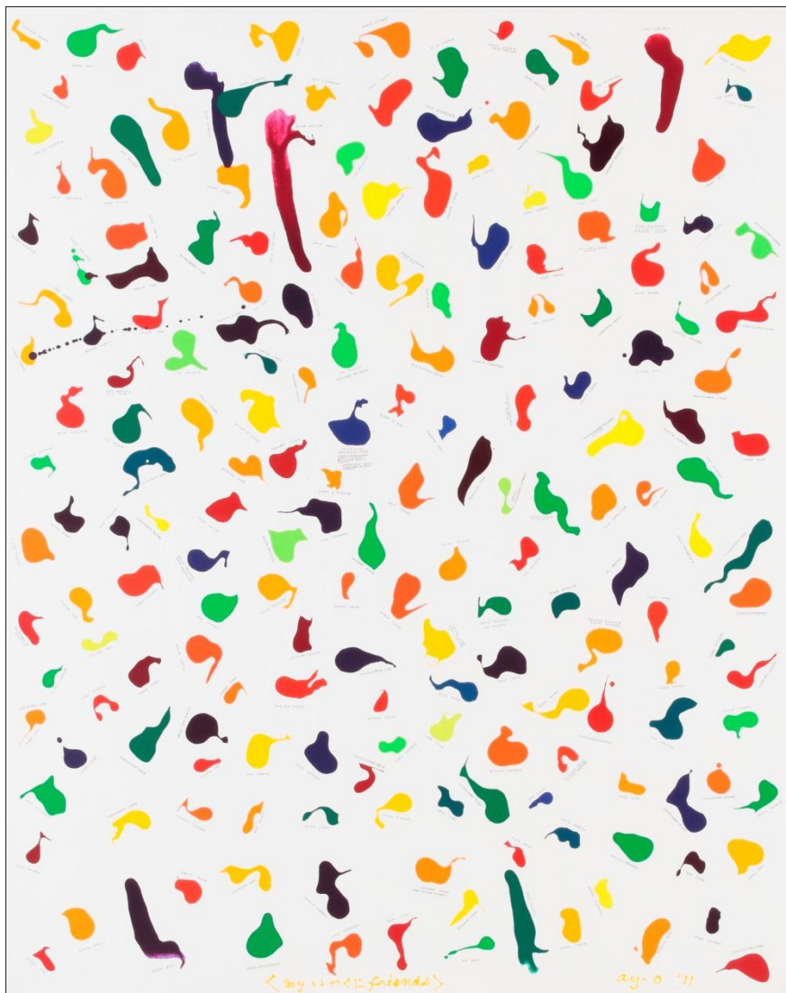
Ay-O, My 192 Friends , 2011