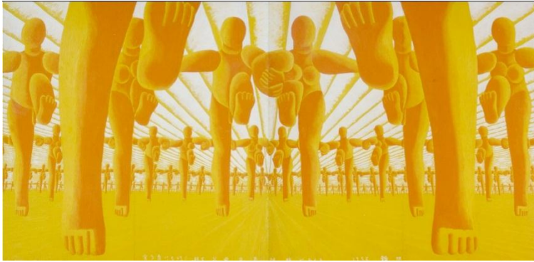
① Ay-O, Pastoral , 1956, Collection of Museum of Contemporary Art Tokyo

Please fill in the form next page and send us fax or e-mail for requests.