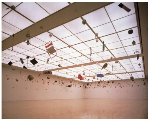
④ Ay-O, Hanging Pieces No. 10 Object Mandala , Installation view at Kitakyusyu Municipal Museum of Art, 1997