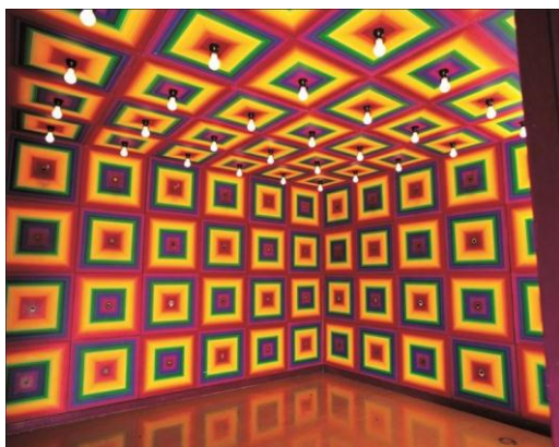
⑤ Ay-O, Rainbow Environment No. 7: Tactile Rainbow Room + Rainbow Ames Box , 1969