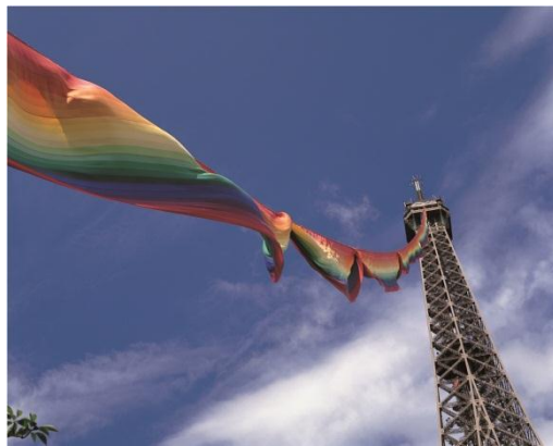
② Ay-O, 300 meter Rainbow Eiffel Tower Project , Paris, 1987