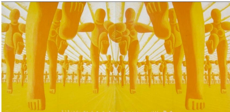
① Ay-O, Pastoral , 1956, Collection of Museum of Contemporary Art Tokyo

Please fill in the form next page and send us fax or e-mail for requests.