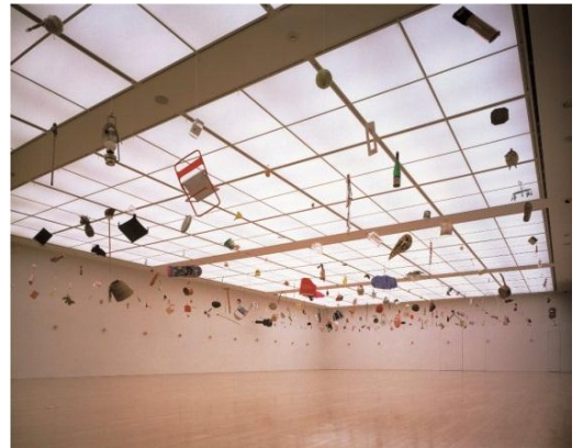
④ Ay-O, Hanging Pieces No. 10 Object Mandala , Installation view at Kitakyusyu Municipal Museum of Art, 1997