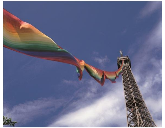
② Ay-O, 300 meter Rainbow Eiffel Tower Project , Paris, 1987