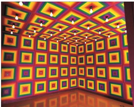
⑤ Ay-O, Rainbow Environment No. 7: Tactile Rainbow Room + Rainbow Ames Box , 1969