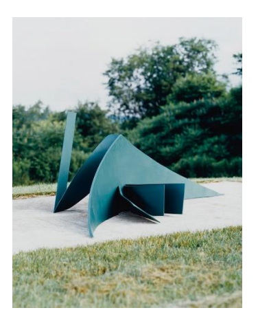
5 ANZAI Shigeo, Anthony Caro, "Sea Change", 1970 [Photographs for "CARO by ANZAI, 1992] 1994, 2014