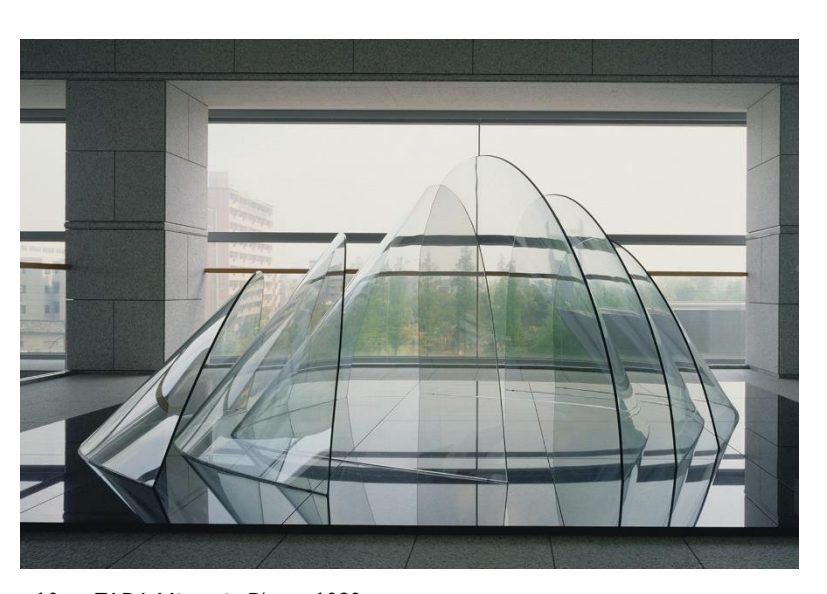
10 TADA Minami, Phase , 1989