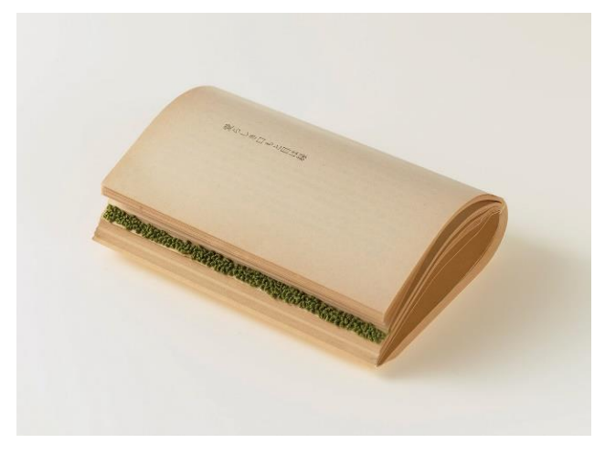
8 FUKUDA Naoyo, Nine Stories #2 , 2003