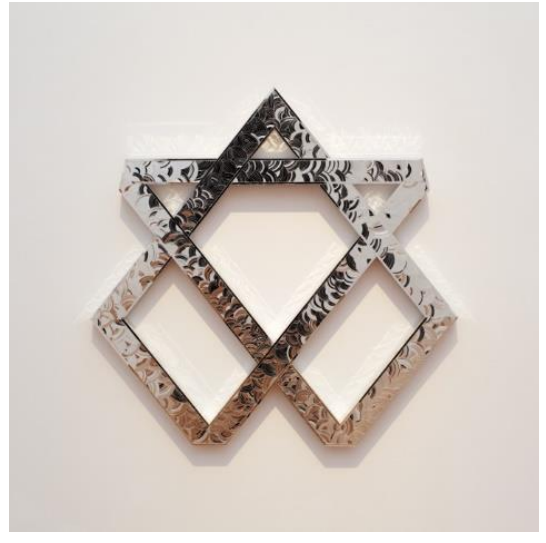
9 Monir Shahroudy FARMANFARMAIAN, Heptagon,2008