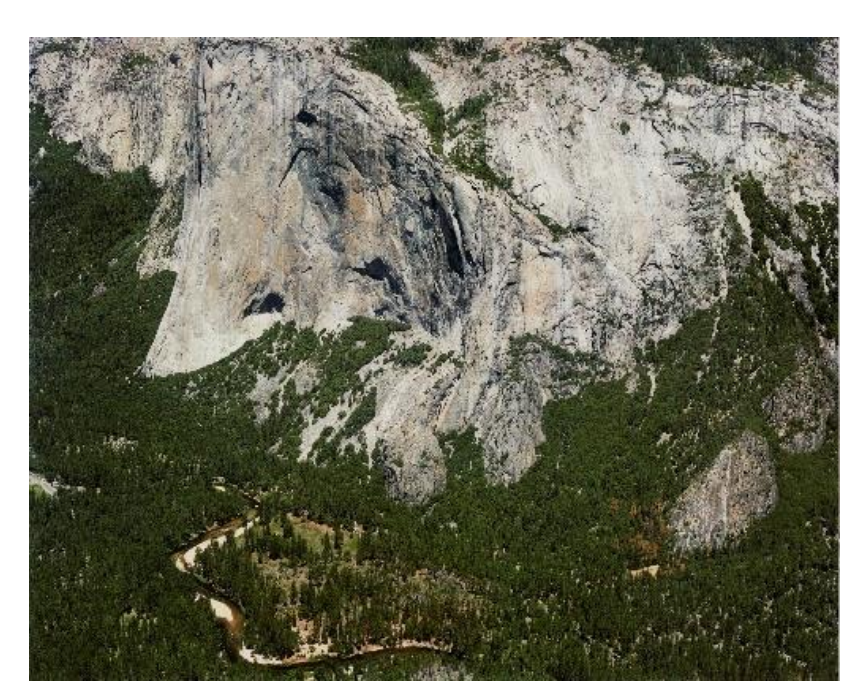
13 MATSUE Taiji, YOSEMITE 35140, 2023