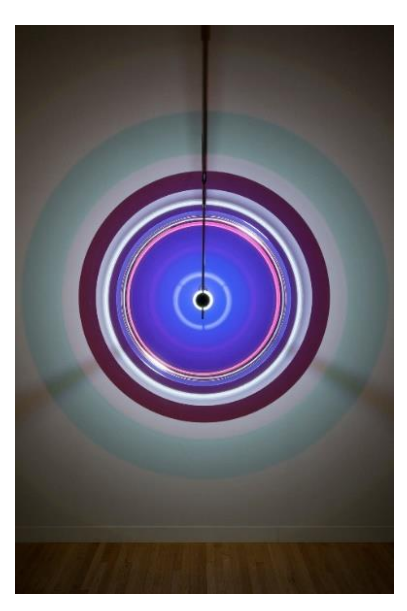
7 Olafur ELIASSON, Beyond- human resonator , 2019 © Olafur Eliasson