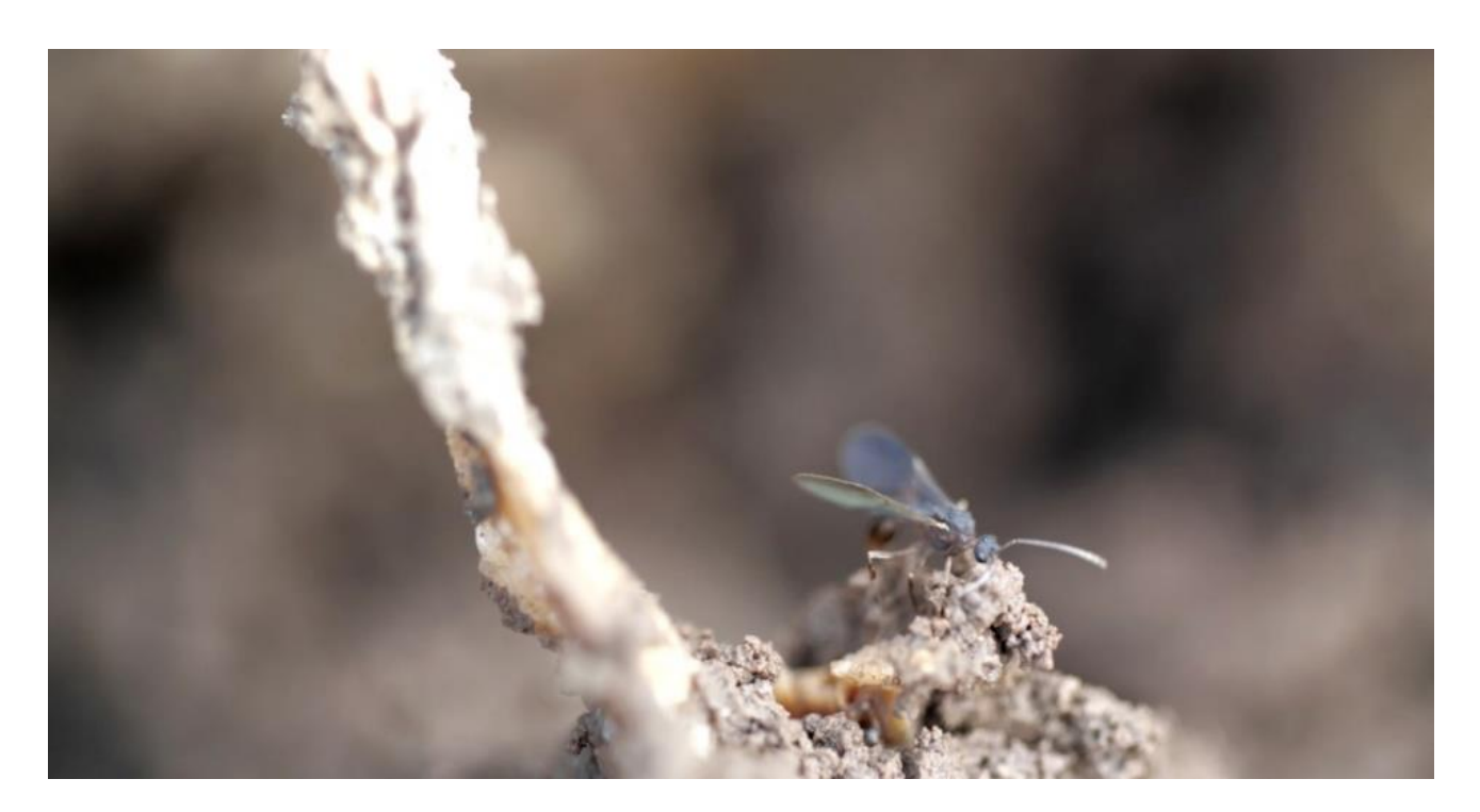
14 Maya WATANABE, Liminal, 2019